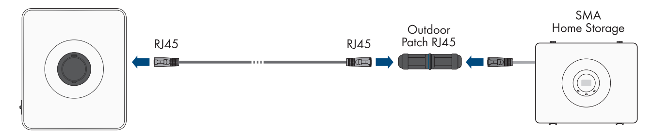
Figure 2: Cabling plan of Sunny Boy Smart Energy with SMA Home Storage

To connect the Sunny Boy Smart Energy to the SMA Home Storage, you must use an RJ45 adapter for the plug connection. The adapter is included in the scope of delivery of the battery.