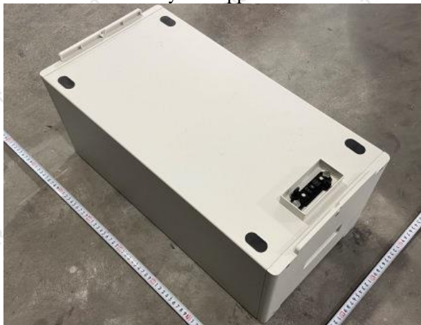
电池侧面外观 Battery side appearance