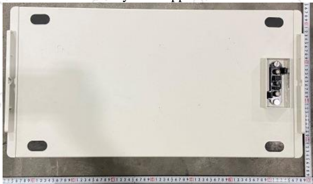
电池正面外观 Battery front appearance