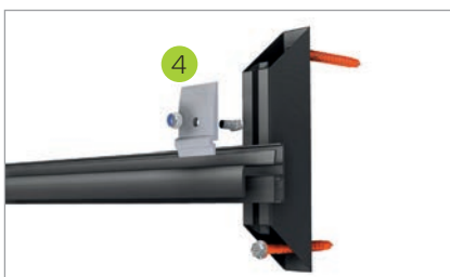
Few components - simple and fast installation