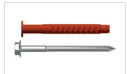
Dowels with technical approval