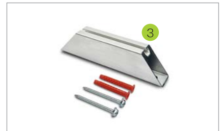
Socket set, optional in blank and black