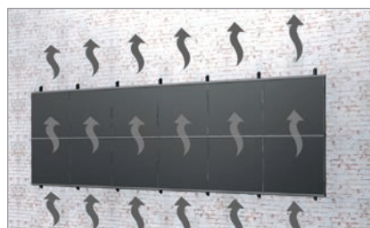
Very good rear ventilation of the modules